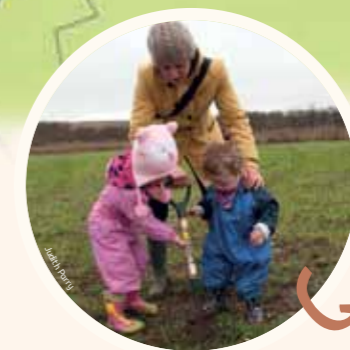
We're not finished yet! Come along to a tree planting event and be part of creating Heartwood.