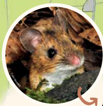
As an indicator of good habitat quality it's great to know the wood mouse is making its home here.