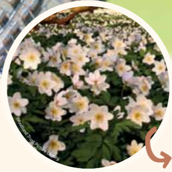
Star-shaped wood anemones flower before the bluebells in spring.